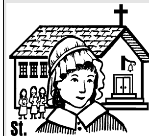
St. Elizabeth Ann Seton